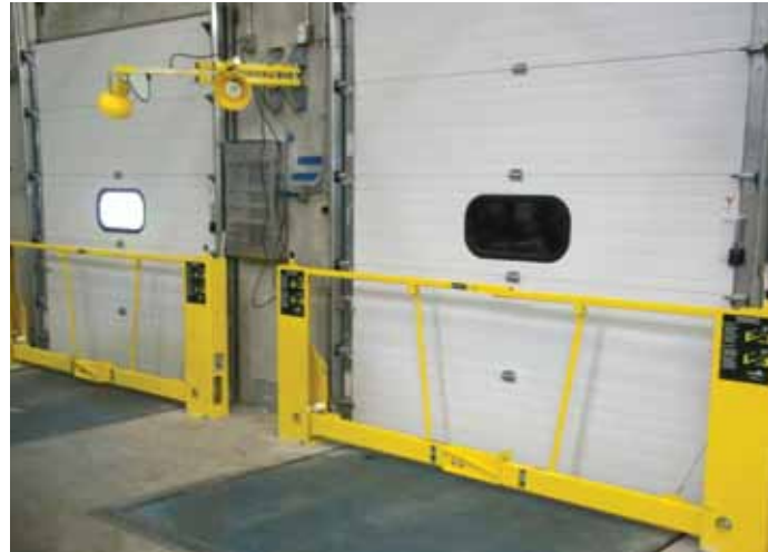
Prevents damage to overhead door tracks and panels

“The NOVA Dock Sentinel Safety Gate is a manually operated gate style barrier. When dock use is required, the NOVA Dock Sentinel Safety Gate is opened by simply lifting the gate into an upright position until latched with very little effort. When dock use is finished, each side of the gate is unlatched and lowered back to the closed position.”