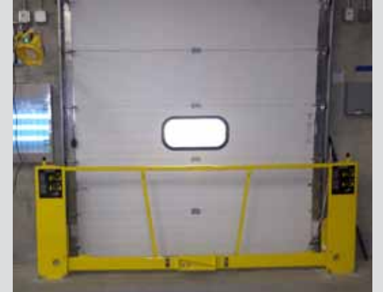
Provides three functions in one—dock door protection, door track protection, and pedestrian protection.