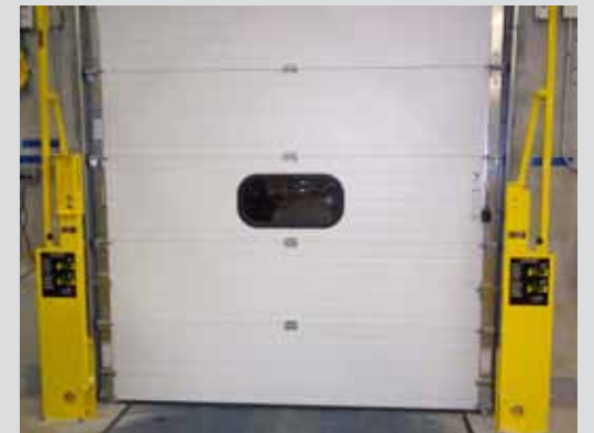
When open, gate provides full door width pass-thru clearance